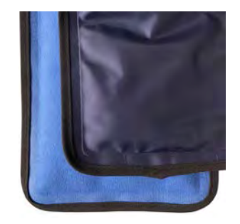
Built To Last Includes a heavy-duty nylon exterior and double-sealed seams to prevent leaking.