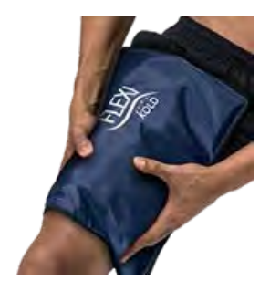
Stays Pliable When Frozen Remains flexible when frozen for improved contact.

When it comes to healing your body, you want the tools the physical therapists and other healthcare professionals are using. The FlexiKold® Gel Cold Pack delivers cooling relief with a professional-grade gel interior that stays smooth and flexible when frozen. Our proprietary gel formula stays colder longer, delivering instant cold therapy you can count on!