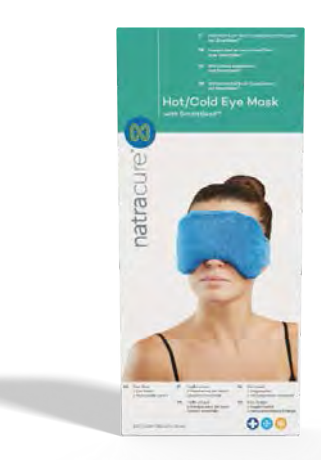
HOT OR COLD EYE MASK HOT/COLD THERAPY SKU: EU416SBNC1

Chill or freeze weighted mask to help reduce swelling and pain of migraines and headaches. Microwaveable SmartBead™ filling allows for soothing, moist heat therapy relief. Heat in microwave to help combat puffy eyes and sinus pain.